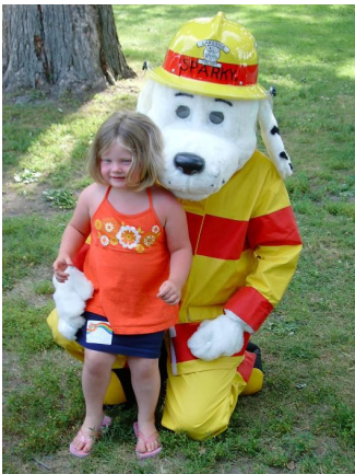
Sparky the Fire Dog & Friend

The Early Intervention department began hosting Make It-Take It (MI-TI) workshops for families with young children this year. MI-TI workshops encourage families to connect, little ones to play & learn together and for everyone to take home something they created.